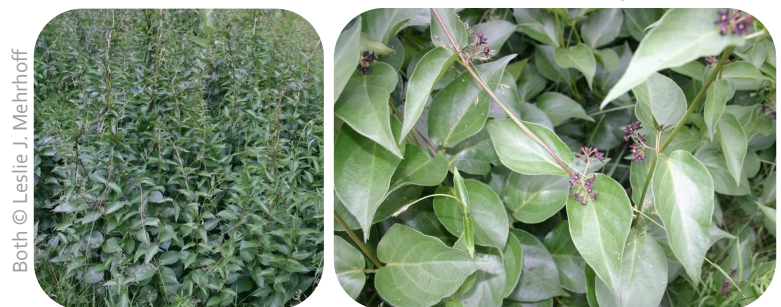
Both